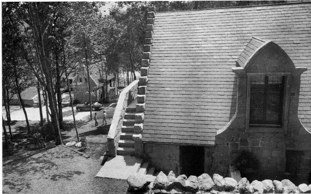
Mountainside view of Julian Morton's town house at Invershiel is a reproduction of one of the main towers of Claypots Castle in Scotland. Stairs at left lead to guest quarters. The dwellings seen at left, below, are grouped around a large compound.