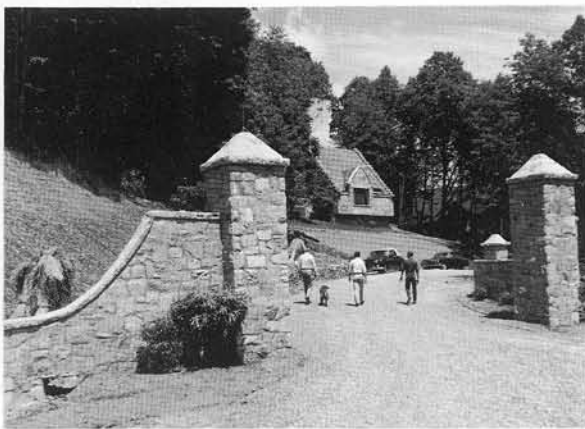
Invershield, Incorporated - Box Eight, Linville, North Carolina